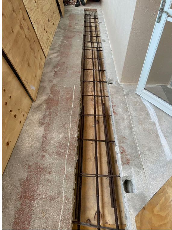
Picture 1: 1 st floor walkway repair prior to top steel installation